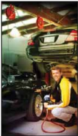
Fry's Napa AutoCare Center, Columbia City, IN